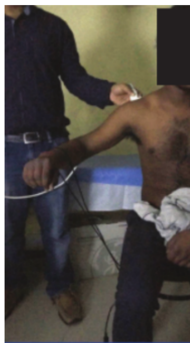
Fig. 1. RTUS images of AHD measured at 45^\circ shoulder abduction

Statistical analysis of the measured AHD was performed using SPSS software version 21.0 (SPSS Inc. Chicago, Illinois). The demographic and anthropometric characteristics were taken at baseline. The AHD data were expressed as mean \pm standard deviation and the units of measurement were in millimetres (mm). The normality of the data was assessed with the Shapiro-Wilk test. For continuous data, the unpaired t-test was used to find the difference between age, height, weight BMI, years of playing, and AHD on the affected side at baseline, while a chi-square test was used for categorical data. The paired samples t-test (within-group) was used to compare mean \pm standard deviation (SD) of the AHD values between baseline and eight weeks post-intervention. Levene's test was used to assess the homogeneity of variance, and Mauchly's test of sphericity for the assumption of sphericity ( p > 0.05 referenced as a violation of sphericity). To elucidate the effect of each intervention on outcome measure (AHD: 0^\circ ; AHD: 45^\circ ; AHD: 60^\circ ), two-way repeated measure ANOVA (analysis of variance) ( 3 \times 2 ) was carried out with time (baseline and post-intervention; Week 8) as within-subject factors, and groups (ET plus MT and MCE) as between-subject factors.